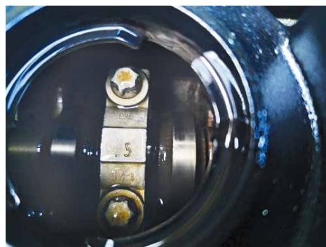
After: Removing yellow lacquer after 1,200 miles, oil consumption reduction